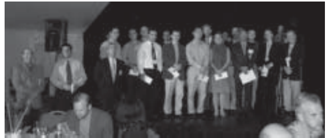
Resident Travel Award Winners